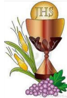
Most Holy Body and Blood of Christ

Corpus Christi celebrates the Eucharist. It is a time to reflect on the gift of Jesus' Body and Blood. This feast day helps us appreciate Jesus' lasting gift in the Eucharist. Let us remember and celebrate this gift together.